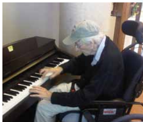
Wellesley Central Place's Got Talent