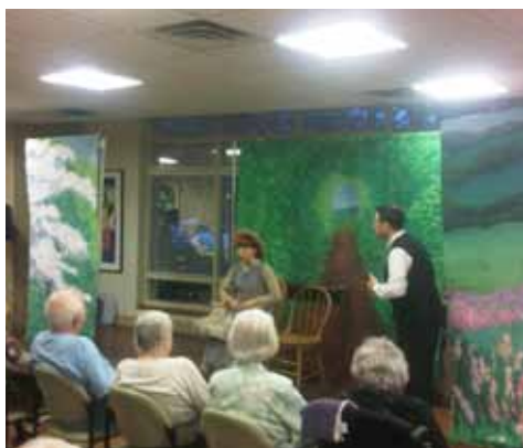
"The Smile Theatre" visits us