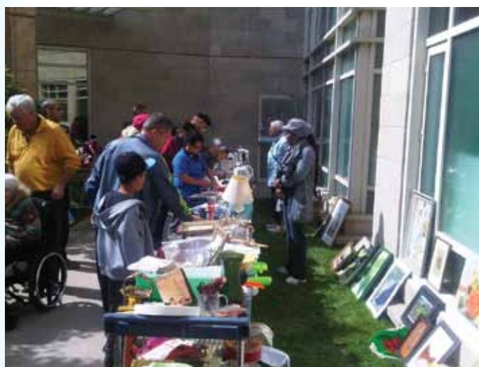
Yard Sale at the Rekai Centre