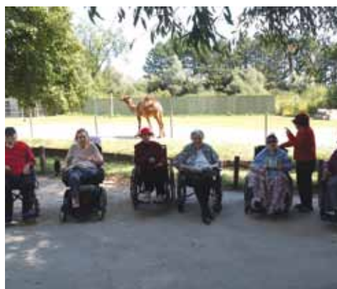
Touring the Toronto Zoo