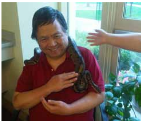
The Zoo comes to us