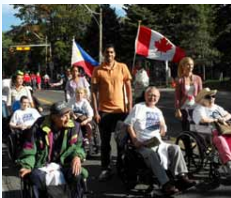
Residents participate in the Cabbage town festival