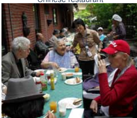
Enjoying a BBQ in our backyard