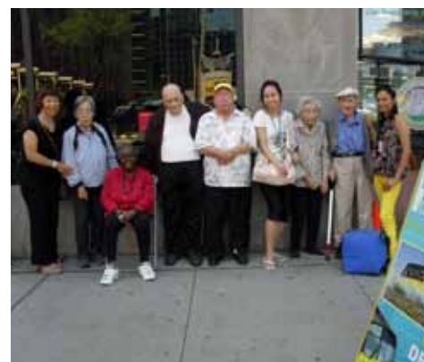
Taking a ride on the “Hippo Bus”