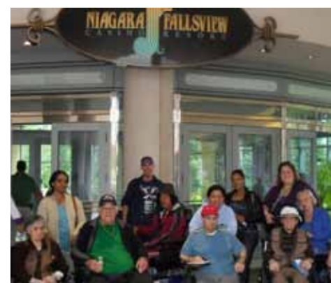
Trying our luck at Fallsview casino