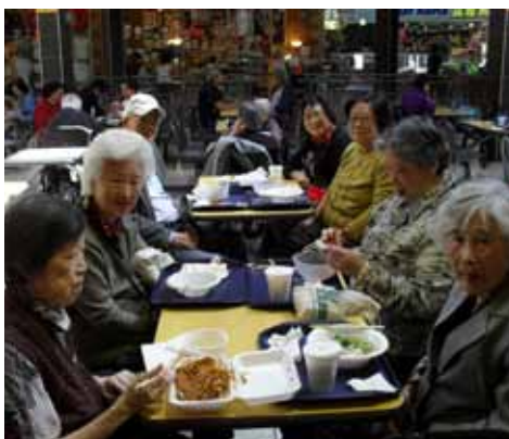
Enjoying a meal in a Chinese restaurant