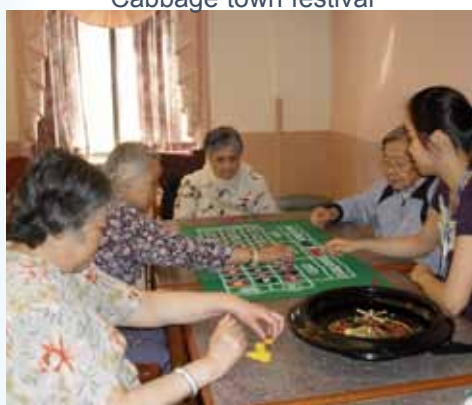
Playing a game of mahjong